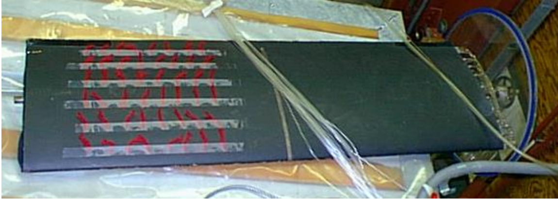
Figure 1. Two-dimensional wing showing pressure tap locations (light colored line at centerline of airfoil), red tufts used to visualize separation and tubing used to connect pressure taps to Scanivalve.