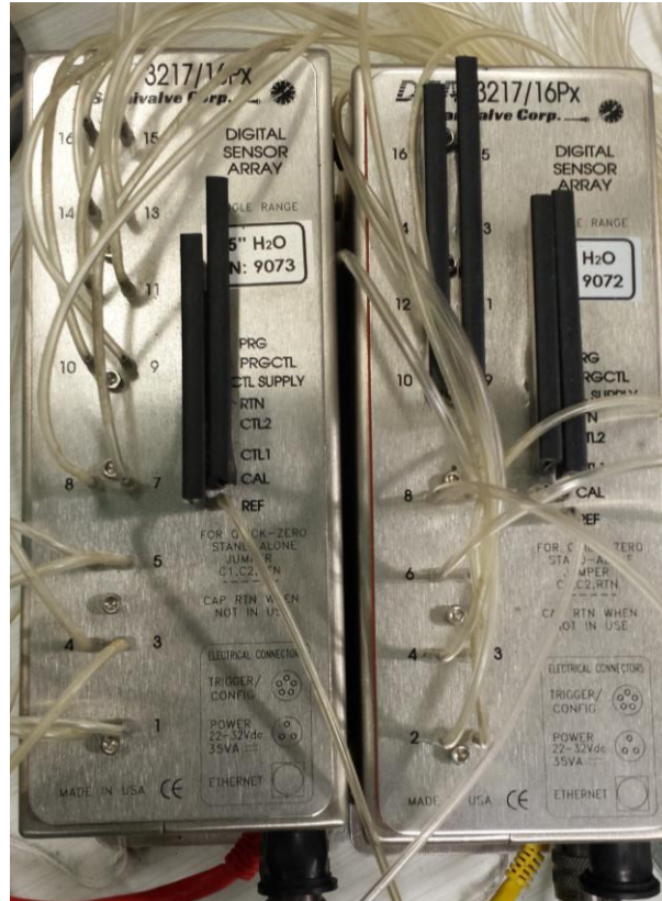
Figure 3. Picture of the two Scanivalve units.