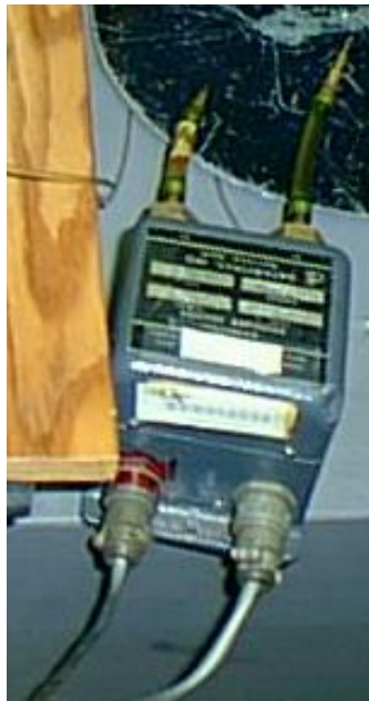
Figure 2. Picture of the Barocel transducer.